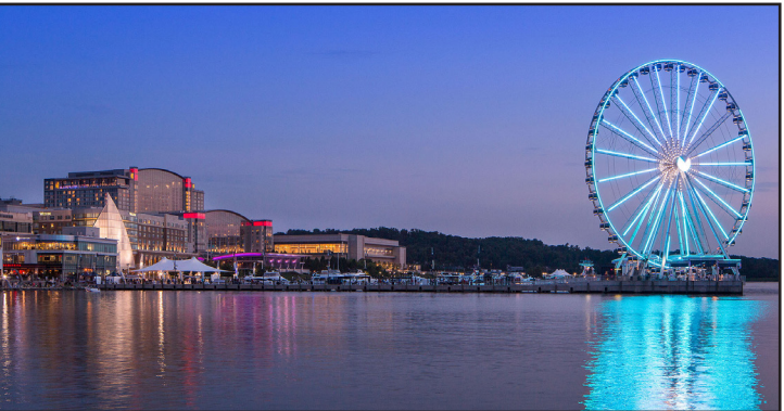
The image on the left features the ocean view of the Ocean City Boardwalk along with its well known ferris wheel. The image straight above shows one of the many record holding men from the Ripley's Believe It or Not Museum.

5 Start your day on the Ocean City, Maryland boardwalk with a morning bike ride. You can bring your own or rent one from one of our many bike shops. Or, if you'd rather just sit back and ride, the boardwalk tram can whisk you anywhere in minutes, while you enjoy a beautiful ocean view. Day or night, there's always something happening - and quite often, it's free. Amusements and arcades are fun for children of all ages. Catch a spectacular view from the top of our ferris wheel. Scream with delight on our roller coaster or savor the slower pace of our magnificent 1902 carousel. Oh, and don't forget to stop by one of our many arcades and play to win!