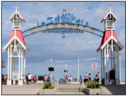
The image on left shows the front entrance of the Ocean City Boardwalk. The image on the right features the interior of the Walters Art Muesum in Baltimore, Maryland. The image straight below shows the oceanview of the National Aquarium building.