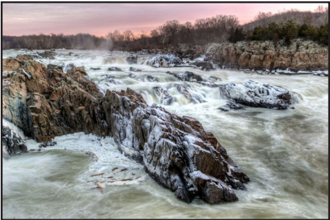
The image above was taken at the Great Falls in Potomac, Maryland.