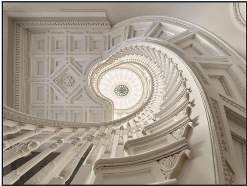
The image above was taken at the Walters Art Museum in Baltimore, Maryland.